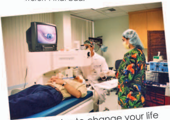
Ten minutes to change your life